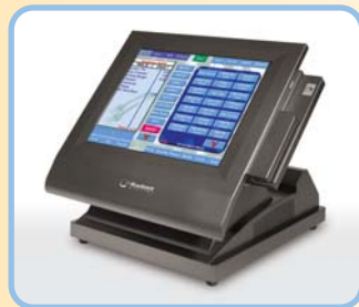
RADIANT P1210 POINT-OF-SALE