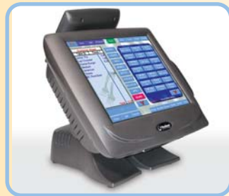
RADIANT P1500 SERIES POINT-OF-SALE